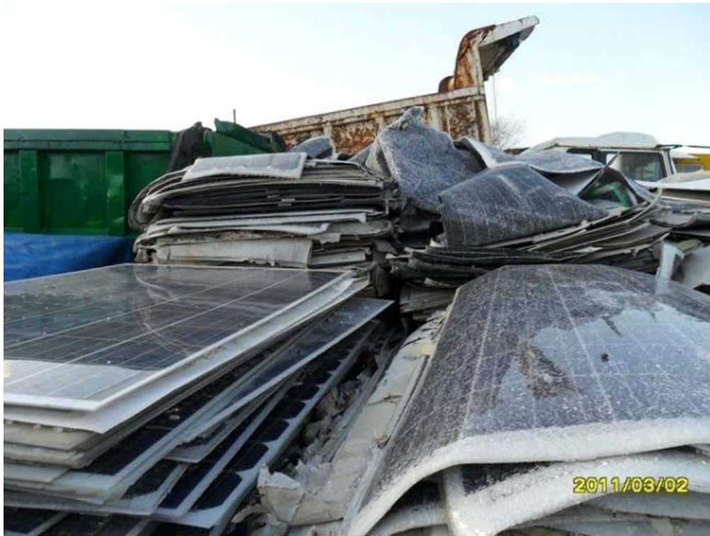
Figure 4: The mangled PV panels in this picture illustrate the nature of broken solar panels; the glass cracks but the panel is still in one piece.

PV panels constructed with the same basic components as modern panels have been installed across the globe for well over thirty years. 3 The long-term durability and performance demonstrated over these decades, as well as the results of accelerated lifetime testing, helped lead to an industry-standard 25-year power production warranty for PV panels. These power warranties warrant a PV panel to produce at least 80% of their original nameplate production after 25 years of use. A recent SolarCity and DNV GL study reported that today's quality PV panels should be expected to reliably and efficiently produce power for thirty-five years. 4