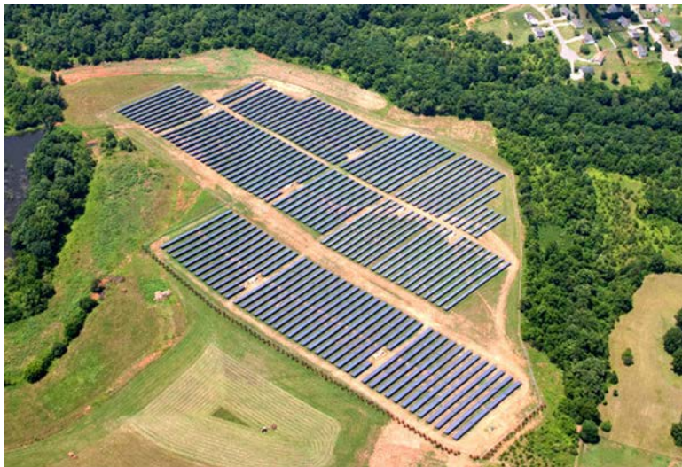
Figure 1: Utility-scale solar facility (5 MW AC ) located in Catawba County.

The system installation, or construction, process does not require toxic chemicals or processes. The site is mechanically cleared of large vegetation, fences are constructed, and the land is surveyed to layout exact installation locations. Trenches for underground wiring are dug and support posts are driven into the ground. The solar panels are bolted to steel and aluminum support structures and wired together. Inverter pads are installed, and an inverter and transformer are installed on each pad. Once everything is connected, the system is tested, and only then turned on.